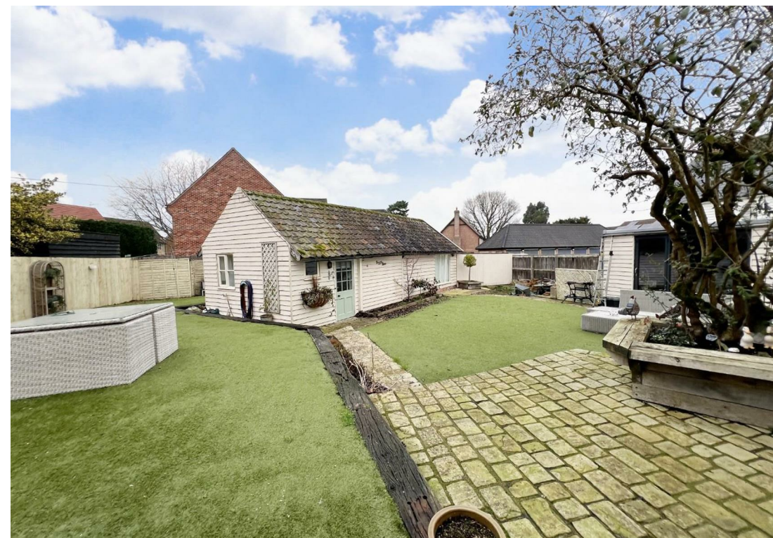
Beautifully Renovated Grade II Listed Thatched Cottage with Annexe

A stunning recently rethatched Grade II Listed four-bedroom detached cottage, set in the heart of a well-served and picturesque village. This exceptional home combines charming period features with modern comforts, offering both spacious living and a self-contained annexe—ideal for guests, home working, or multi-generational living.